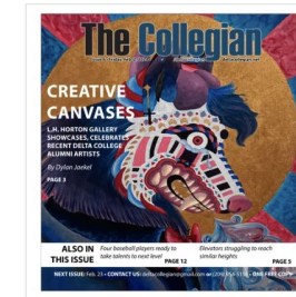
The Collegian - Published February 1, 2024