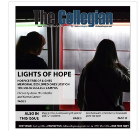
The Collegian - Published December 1, 2023