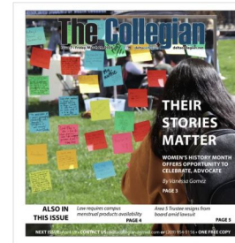
The Collegian - Published March 28, 2024